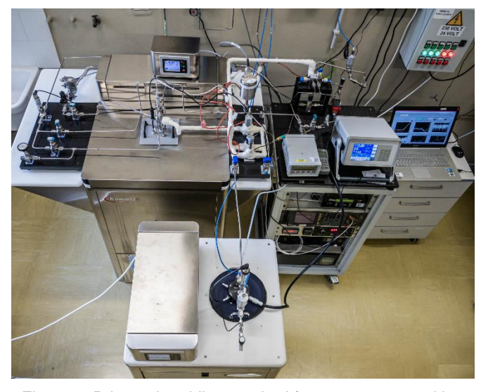
Figure 2. Primary humidity standard for trace water working down to -105 °C.

In the framework of the project, primary humidity standards for trace water based on a variety of principles are being developed. The realisation of a saturation-based trace water generator able to work down to -105 °C frost-point temperature (5 ppb amount fraction) at pressures up to 0.65 MPa in nitrogen and argon has been completed, and the system is in operation (Fig. 2). The generator meets and exceeds the expected performance targets. The capability is the first in Europe and among the few in the world. A thorough characterisation is underway aiming to estimate the combined uncertainty. The extension of the operating range of a second humidity generator based on the saturation principle in nitrogen and air down to -100 °C at 0.11 MPa has been completed. The generator is currently being characterised and a preliminary uncertainty budget has been established. The downward range extension of a coulometric-based generator is also in progress; the development of